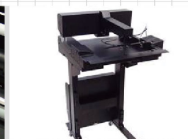
Auto Sheet Feeder (Optional)